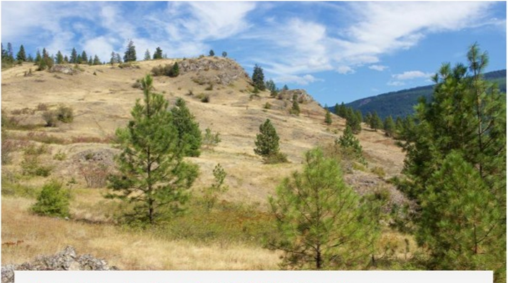
File photo of drought conditions in Kalamalka Provincial Park