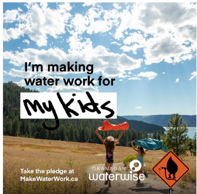
Who are you making water work for post