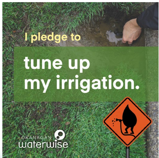
"I pledge to" post graphic