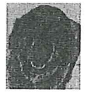
Calvin News Hound

4437 - 3rd Street P.O. Box 1150 Peachland BC, V0H 1X0 Tel: 250-767-7771